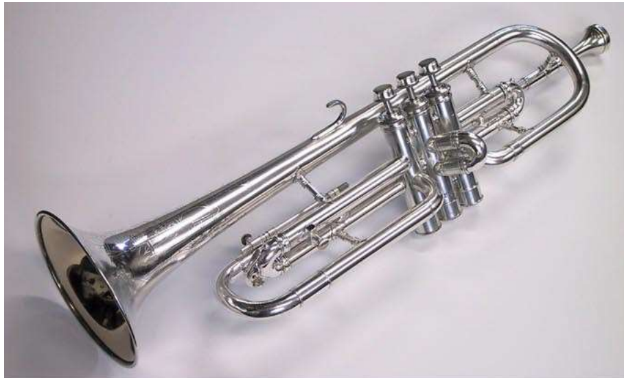
Cornet #122113 (Horn-u-copia.net)