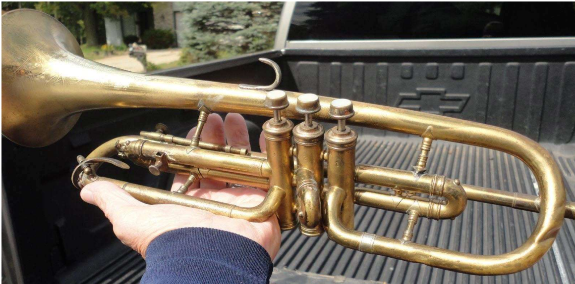
Airflow cornet #120725 (Auction photo)

I believe this is the same one later restored. The bell braces were loose and the owner tried playing it without the front brace only to find he liked the sound better so left it off.