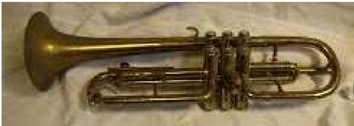
Cornet #121200

I believe this is the same one later restored. The bell braces were loose and the owner tried playing it without the front brace only to find he liked the sound better so left it off.