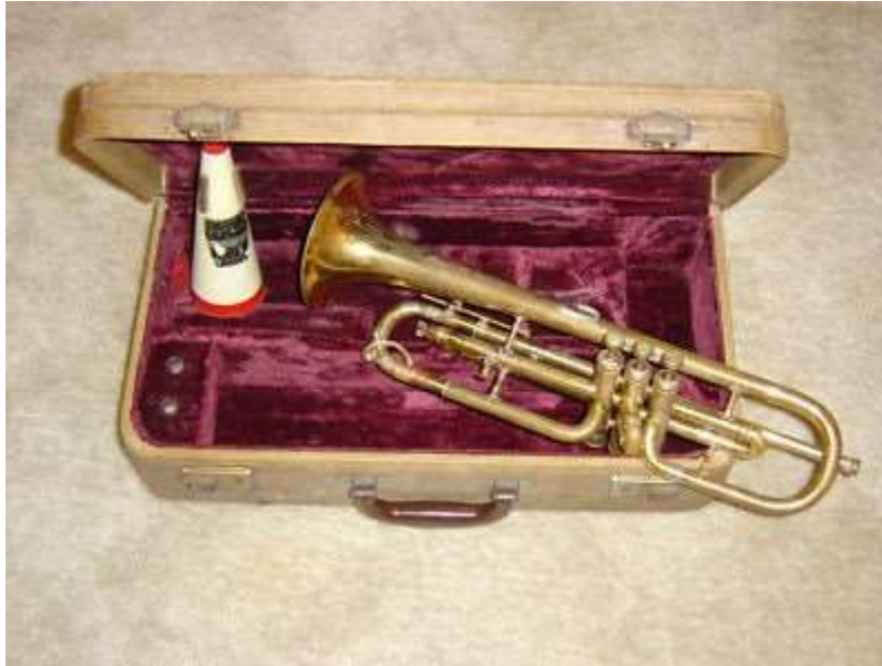
A few cornets that I don't have serial #s for